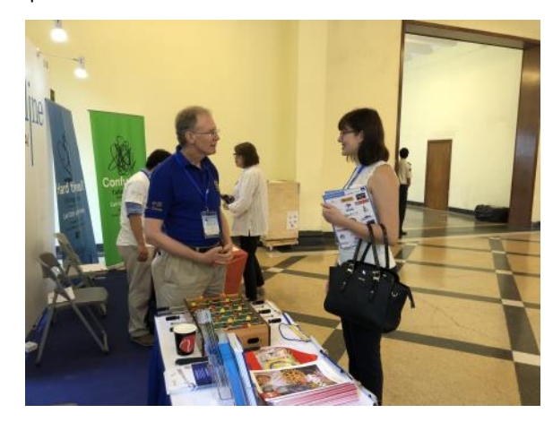
A special thanks to all volunteers and those who visited our booth